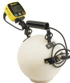
Model 42-49 Detector shown as part of a Model 30-7

The Model 42-49 is designed to be used with portable counting instruments and has a top bracket that allows for convenient mounting of a portable instrument. (See picture below.) The Model 42-49 consists of a {}^3\text{He} detector (1.6 cm diameter x 2.5 cm thick), surrounded by a high density polyethylene sphere, 19.6 cm (7.7 inches) in diameter. This outer sphere moderates the incoming neutrons and helps provide a near-rem response.