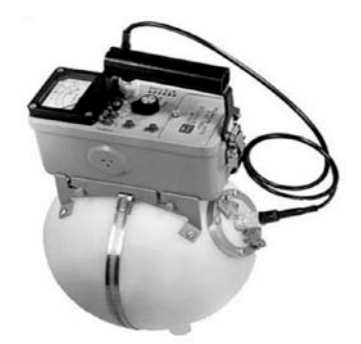
Model 42-31H Detector shown with Model 12-4

The Model 42-31H is designed to be used with portable counting instruments and has a top bracket that allows for convenient mounting of a portable instrument. (See picture below.) The Model 42-31H consists of a <sup>3</sup>He detector (1.6 cm diameter x 2.5 cm thick), surrounded by a cadmiumloaded polyethylene sphere, 22.9 cm (9 inches) in diameter. A study is available that shows that the 9-inch cadmium-loaded sphere has a response similar to that of a 10-inch diameter rem-responding sphere.