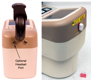
Optional Headset Port