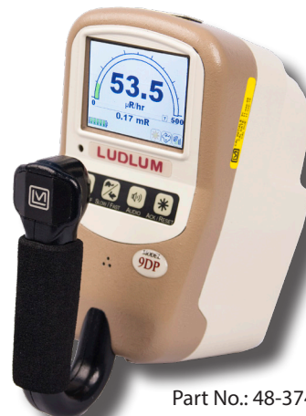
Part No.: 48-3742