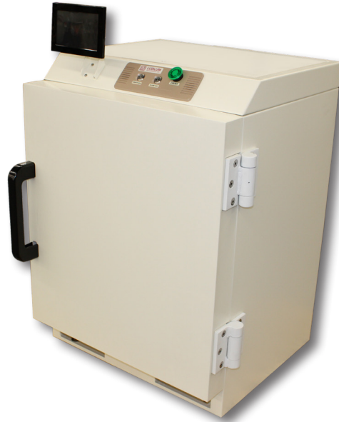
Part Number: 48-3792