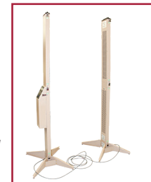
Right: Shown configured as vehicle monitor using optional Conversion Kit (P/N 4215-374)

OPTIONAL VEHICLE MONITOR CONVERSION KIT FOR MODEL 52-1 SERIES: enables the user to reconfigure the Model 52-1 Series personnel portal monitor to a vehicle monitor. Includes stands and cable, monitor available separately. Part Number 4215-374