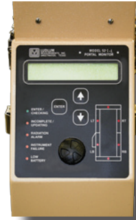
Operation and display panel