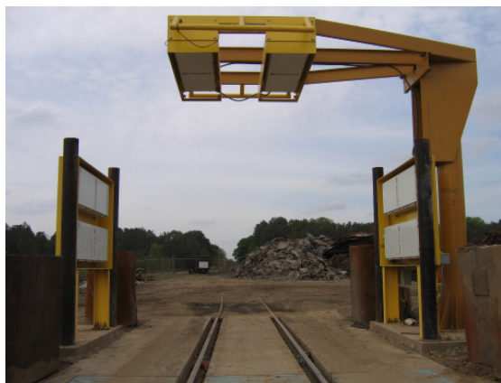
(Shown with optional detector stands)

Key features this system offers include very low false positives, 100 millisecond samples, vehicle counter, rail mode, real-time data logging, bi-directional entry, user-friendly operation, remote HV adjust, battery backup and superior service and support.