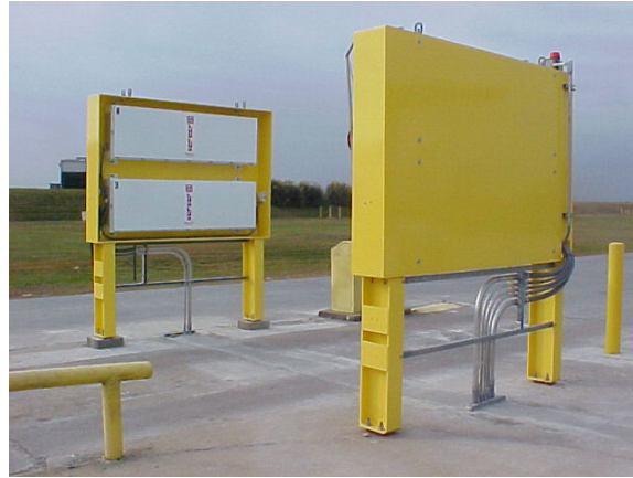
(Shown with optional detector stands)

Key features this system offers include very low false positives, 100 millisecond samples, vehicle counter, rail mode, real-time data logging, bi-directional entry, user-friendly operation, remote HV adjust, battery backup and superior service and support.