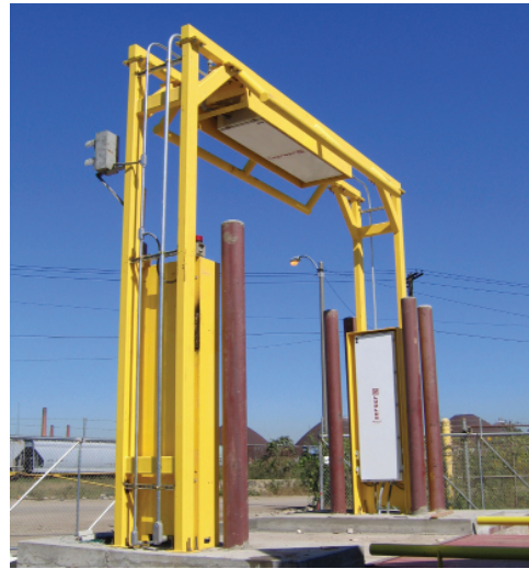
Part Number: 48-3606 (Shown with optional detector stands)

Key features this system offers include very low false positives, 100 millisecond samples, vehicle counter, rail mode, real-time data logging, bi-directional entry, user-friendly operation, remote HV adjust, battery backup and superior service and support.