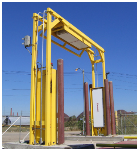
Part Number: 48-3606 (Shown with optional detector stands)

Key features this system offers include very low false positives, 100 millisecond samples, vehicle counter, rail mode, real-time data logging, bi-directional entry, user-friendly operation, remote HV adjust, battery backup and superior service and support.