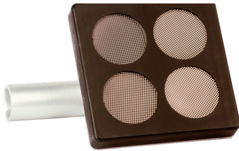
Model 44-89 Square Layout of GMs Part Number: 47-2357