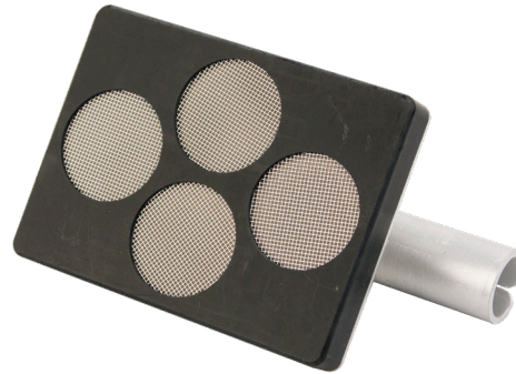
Model 44-94 Diamond Layout of GMs Part Number 47-2390