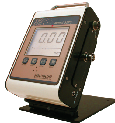
Model 3276 with desktop stand option