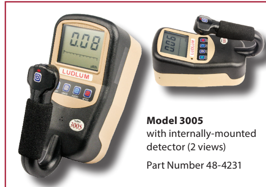
Model 3005 with internally-mounted detector (2 views) Part Number 48-4231