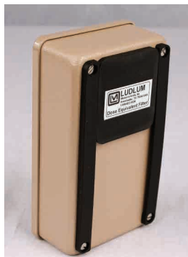
Sliding Dose Equivalent Filter shown closed (above) and open (right).

As most know, the venerable GM pancake has a significant over-response at lower energies between approximately 20 to 160 keV. Any exposure or dose measurements taken with an unfiltered GM pancake detector would thus have unacceptable errors at these lower energies. To counteract this tendency, Ludlum Measurements developed a sliding filter for the Model 2401-P GM pancake detector that flattens the response to within 20% referenced to 137 Cs (662 keV) over an energy range of 20 keV to 1.2 MeV.