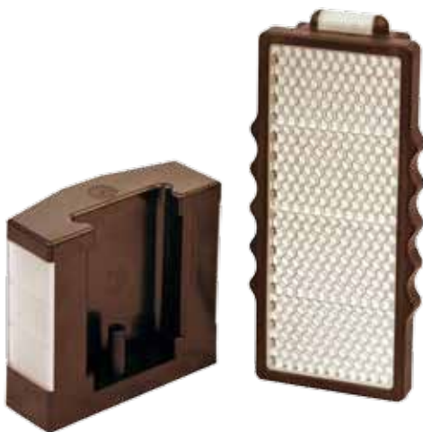
Model 215 shown with the included calibration/charging Stand (Model 215-20)

This innovative, dual-purpose, alpha contamination detection instrument can be used as both a stationary hand frisker, or be operated as any other mobile alpha frisker once it is removed from its charging stand. The convenient, integrated detector design requires no batteries, P-10 counting gas, or cables, giving the user complete freedom in performing frisking duties. The large area, air proportional detector has built-in electronics, display, and capacitors that allow it to be operated up to 30 minutes before needing to be recharged. Fully discharged, the detector is ready for stationary operation within 5 minutes of being placed into the charger stand, and ready for mobile frisking within 20 minutes. The charging stand interfaces to a PC to facilitate setting parameters and running high voltage plateaus via an optional application program.