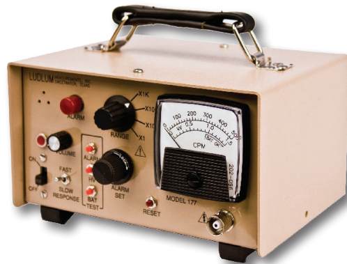
Part Number: 48-1632