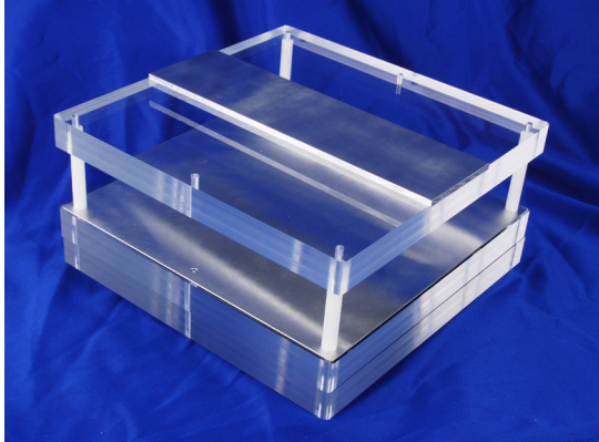
Acrylic Modular X-ray Phantom