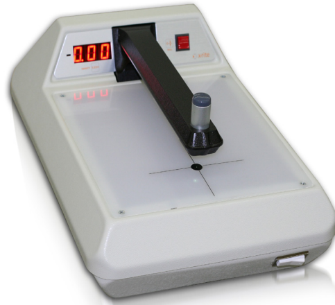
Part Number: 99-9600

Measuring range: 0-5.0 D with 2 and 3 mm apertures; 0-4.0 D with 1 mm aperture