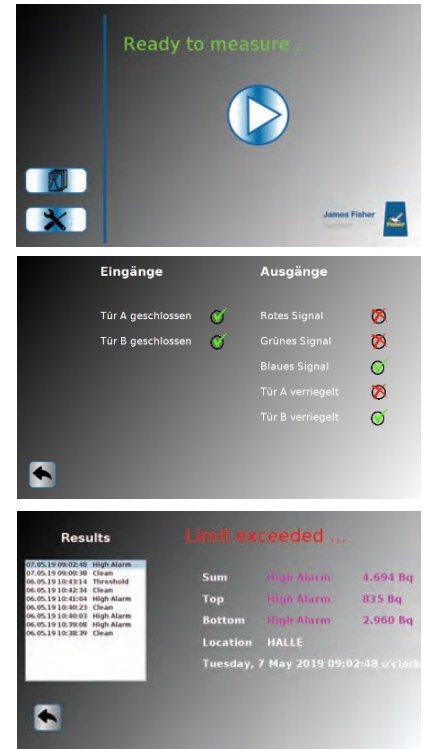
Screenshots of user-software