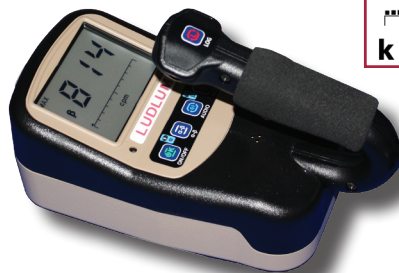
Part Number 48-4037