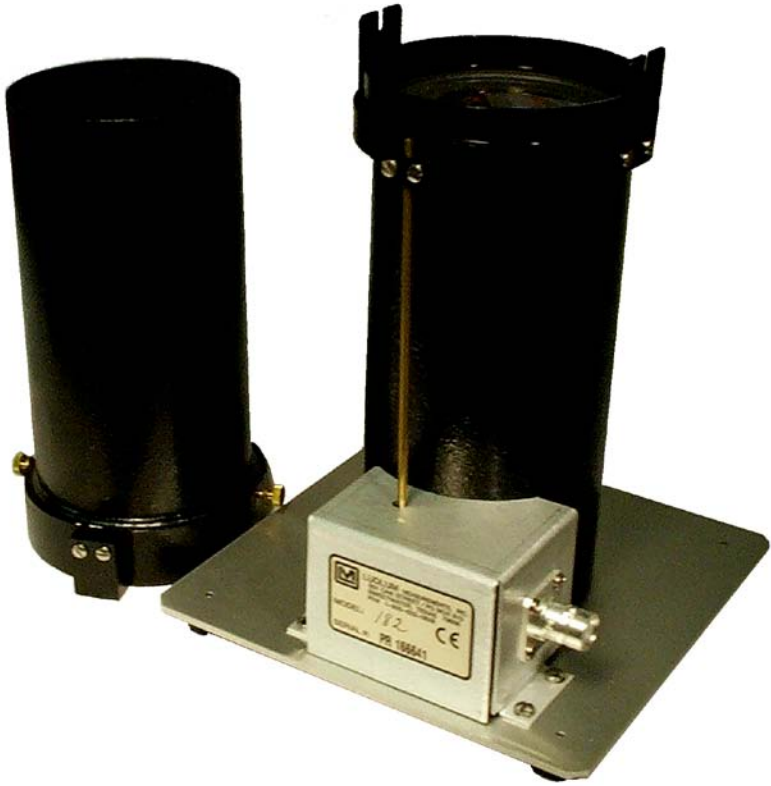
Model 182 Radon Flask Counter – open