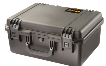
Transport & Storage Case Option

Ludlum Measurements, Inc. P.O. Box 810, Sweetwater, Texas 79556