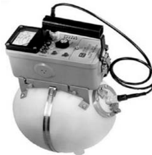
Model 42-31H Detector shown with Model 12-4

The Model 42-31H is designed to be used with portable counting instruments and has a top bracket that allows for convenient mounting of a portable instrument. (See picture below.) The Model 42-31H consists of a {}^3\text{He} detector (1.6 cm diameter x 2.5 cm thick), surrounded by a cadmium-loaded polyethylene sphere, 22.9 cm (9 inches) in diameter. A study is available that shows that the 9-inch cadmium-loaded sphere has a response similar to that of a 10-inch diameter rem-responding sphere.