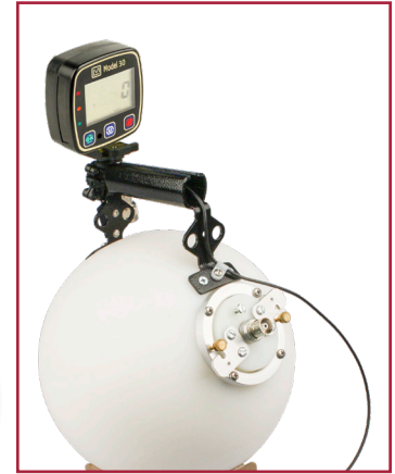
upper left: detail of display unit lower left: base of instrument